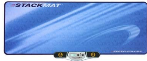
Generation 2 StackMat

4) All styles of the Generation 2 Speed Stacks StackMat® will be permitted at Sanctioned & Recognized WSSA tournaments as provided by the Tournament Director. The Generation 1 model will only be allowed at “Recognized” tournaments.